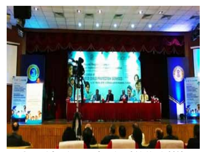
Regional Consultation at Cuttack on 24th March, 2018