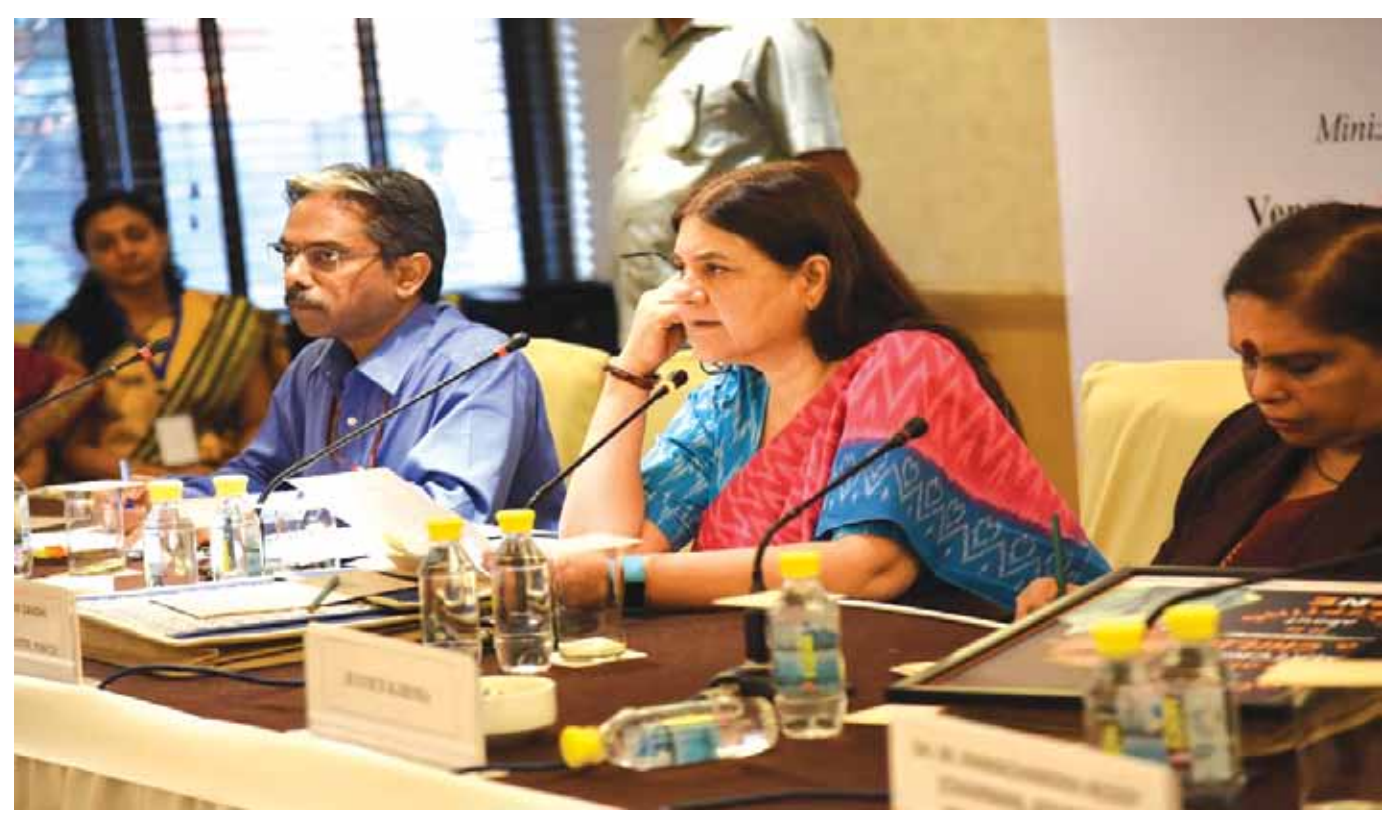
Smt. Maneka Sanjay Gandhi, Hon'ble Union Minister, MWCD and Senior Officials of MWCD during the Review Meeting on Implementation of Adoption Programme by States & UTs at India Habitat Centre, New Delhi on 24<sup>th</sup> October, 2017.