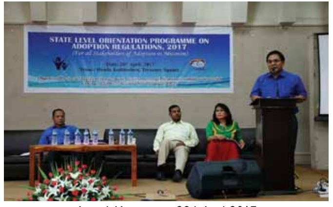
Aizawl, Mizoram on 28th April, 2017