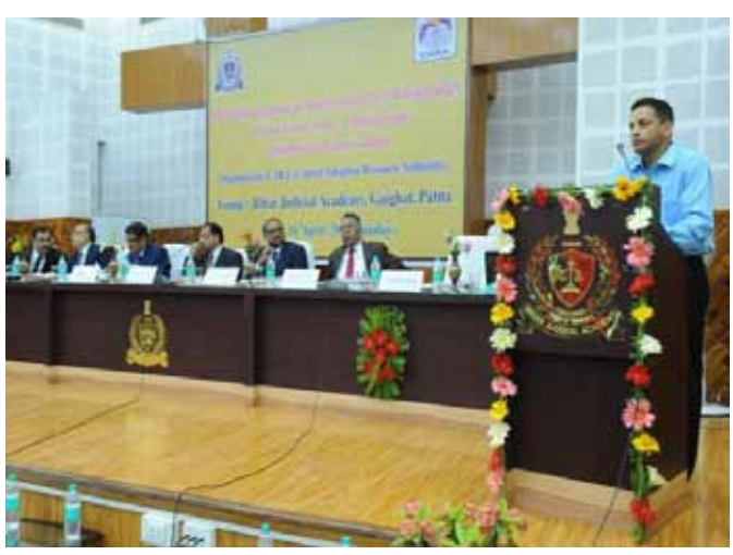
Bihar Judicial Academy, Patna on 16th April, 2017