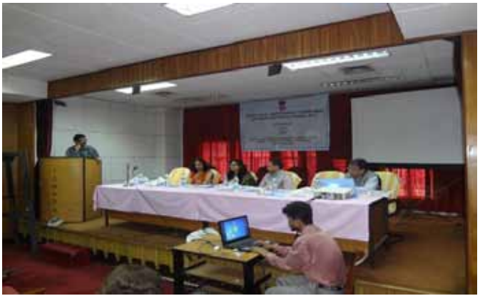
Kolkata, West Bengal on 11th August, 2017