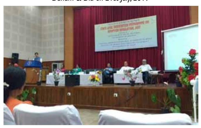
Imphal, Manipur on 16th September, 2017