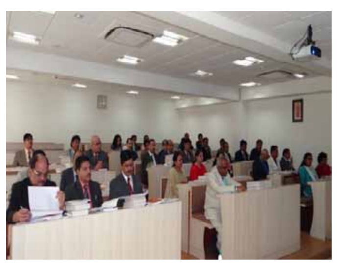
Maharashtra Judicial Academy, Mumbai on 29th & 30th July, 2017