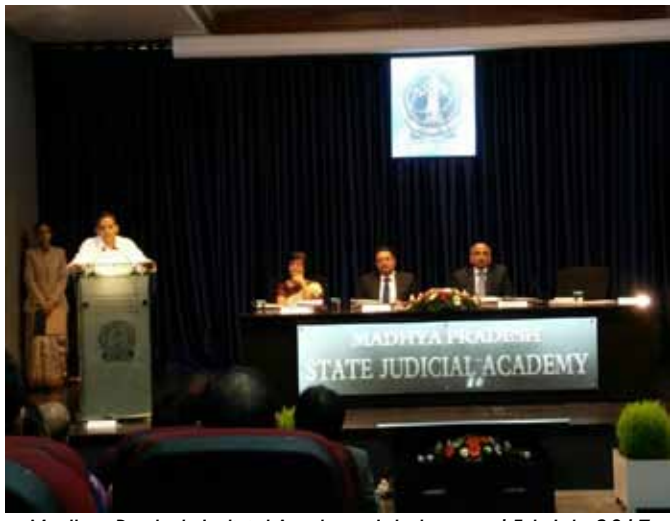
Madhya Pradesh Judicial Academy, Jabalpur on 15th July, 2017