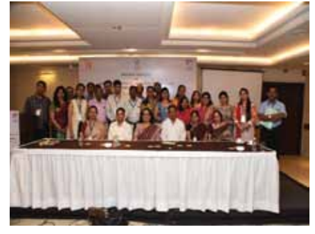
Glimpses of the Review Meeting on Implementation of Adoption Programme by States & UTs at India Habitat Centre, New Delhi on 24th October, 2017