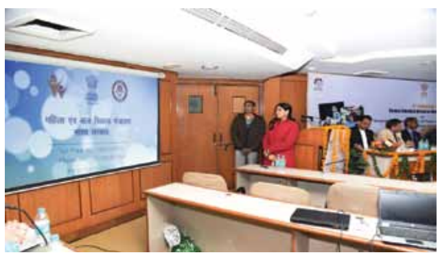
3rd Annual Day of CARA at NCUI Auditorium, August Kranti Marg, New Delhi on 15th January 2018