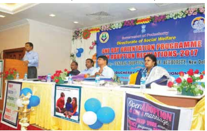
Puducherry on 23rd June, 2017