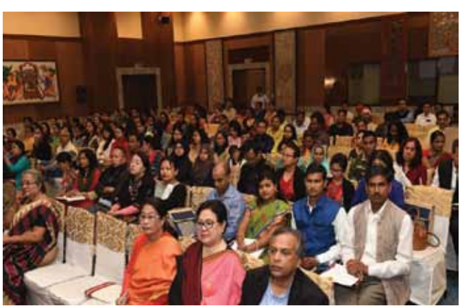
National Seminar on Adoption at Pravasi Bhartiya Kendra, Chanakyapuri, New Delhi on 15th November, 2017