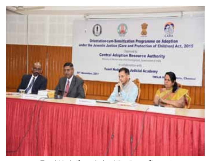
Tamil Nadu State Judicial Academy, Chennai on 5th November, 2017