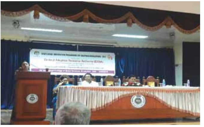
Kerala on 23rd March, 2018