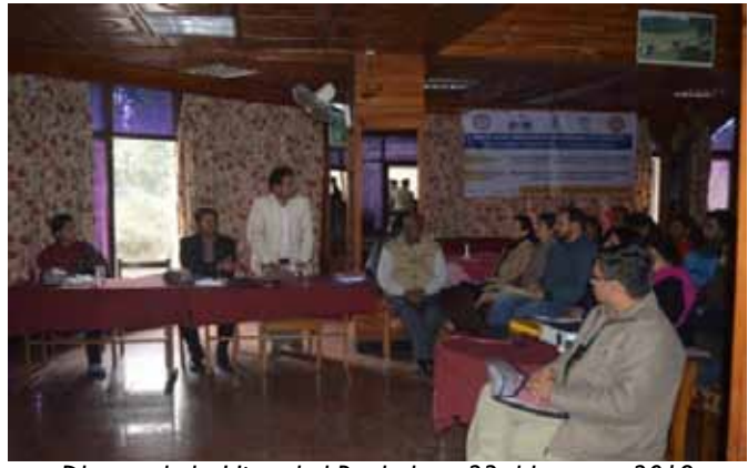
Dharamshala, Himachal Pradesh on 23rd Janurary, 2018