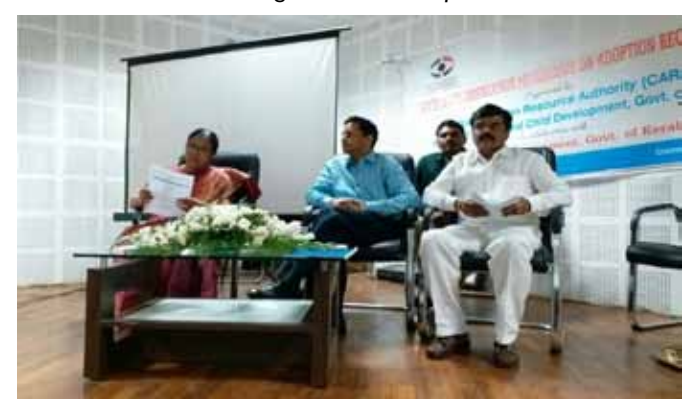
Thiruvananthapuram, Kerala on 11th May, 2017